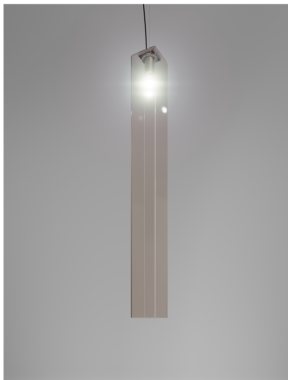
TUBES SP 120 FUTR NO E27 CE